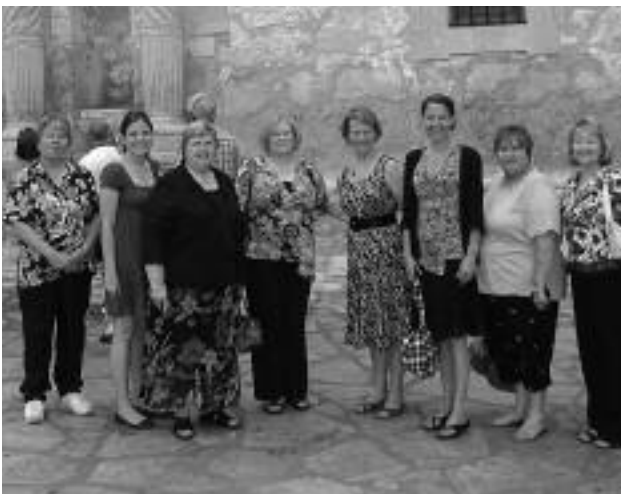
This is the first Intro class of Take Flight at the Scottish Rite Learning Center of South Texas in San Antonio. Class was held June 9 27, 2008.