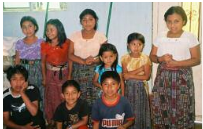
Children from San Pablo la Laguna.