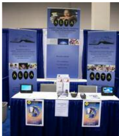
The ALTA booth at the IDA Conference.