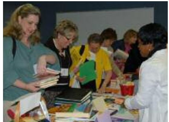
ALTA members looking for great deals at the garage sale.